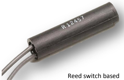
Reed switch based cylindrical proximity sensor