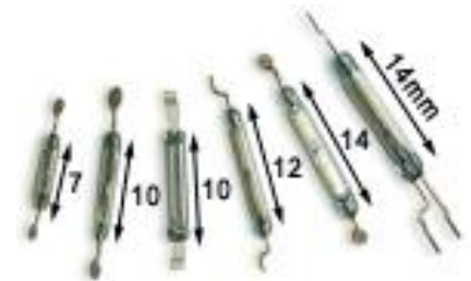
Offener Reedschalter für SMD Montage mit flachen oder runden Anschlüssen