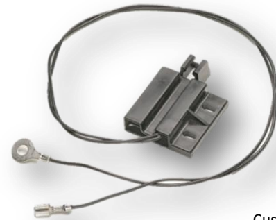
Custom safety shutoff switch and magnet assembly