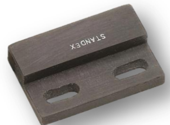
Erkennung der Tür- und Fensterposition