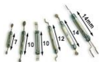
Offener Reedschalter für SMD Montage mit flachen oder runden Anschlüssen