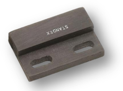
Erkennung der Türund Fensterposition